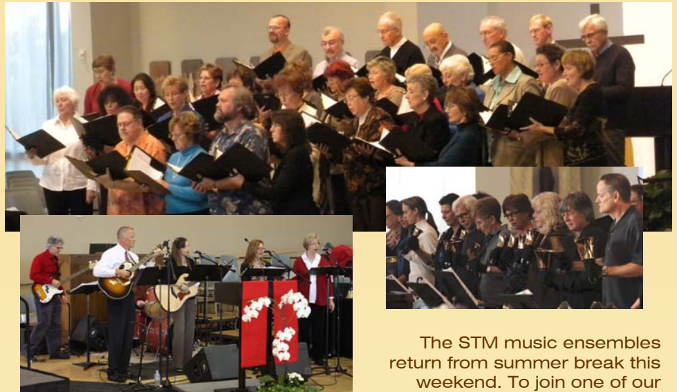
The STM music ensembles return from summer break this weekend. To join one of our ensembles, see page 6 for rehearsal times.

A Roman Catholic Parish in the Diocese of San Diego