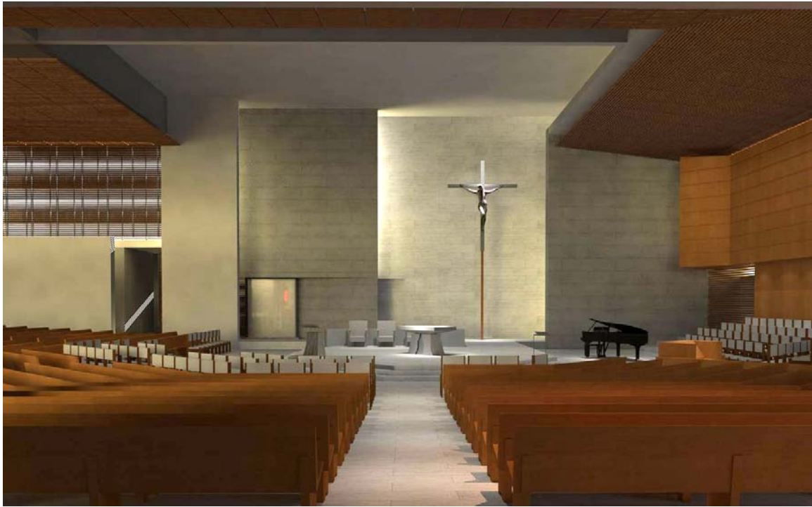
Looking toward the altar from the St. Thomas More Shrine